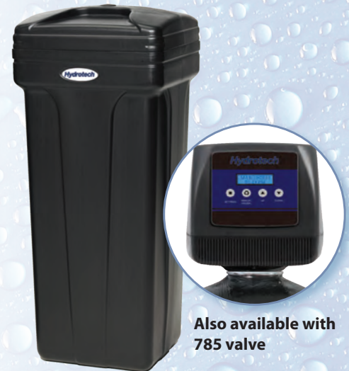
Brine Tank Included